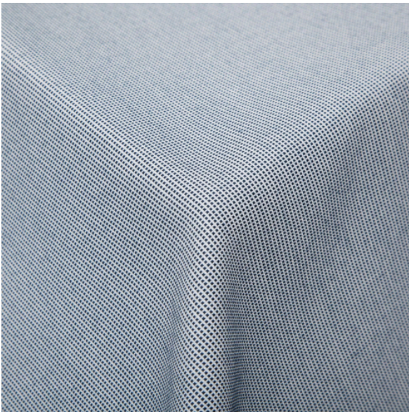
Colours : 9