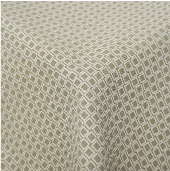
Colours : 7