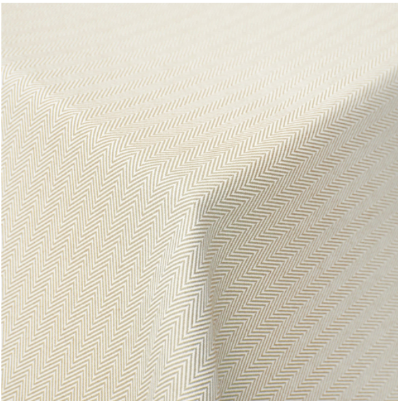
Colours : 7