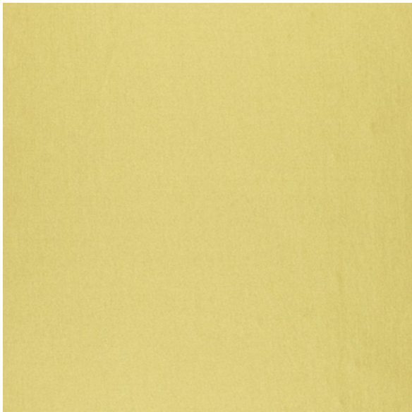
Colours : 57