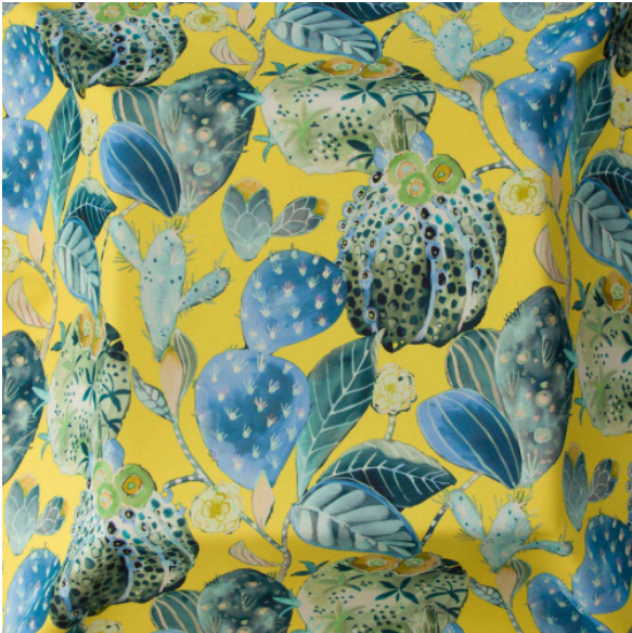
Colours : 2